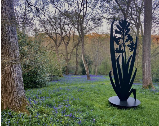
Paul Morrison Hyacinthe 2014 © the artist and courtesy of the New Art Centre, Roche Court